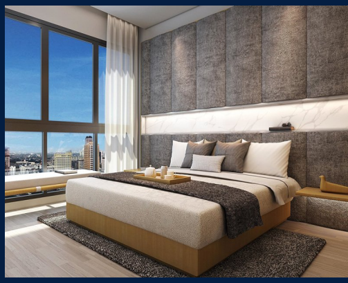
2 - Bedroom + Dual Key