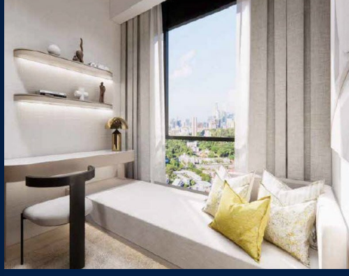
4 - Bedroom + Home Office