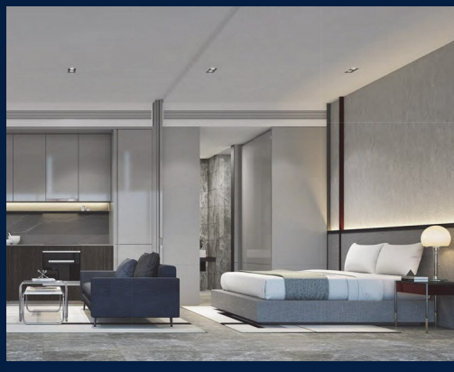
2 - Bedroom + Study