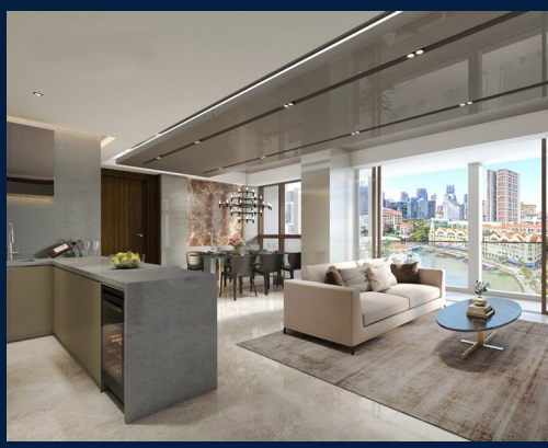
1 - Bedroom + Study