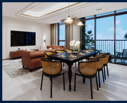
4 - Bedroom + Study