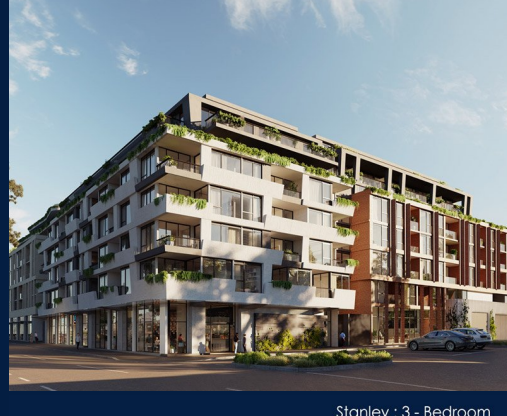
Stanley: 3 - Bedroom