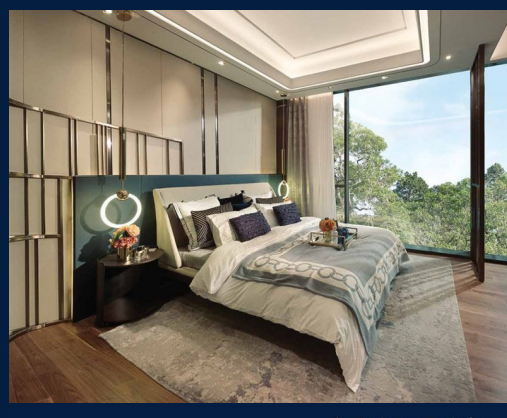
3 - Bedroom Exclusive