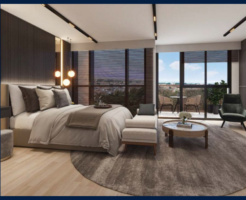
4 - Bedroom Penthouse