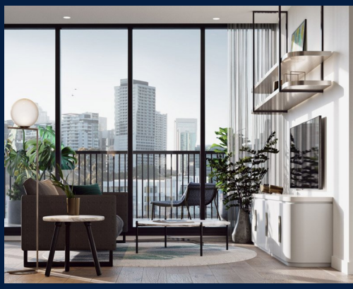
Roden : 3 - Bedrooom + Study