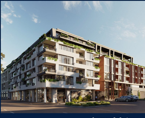
Spencer: 2 - Bedroom